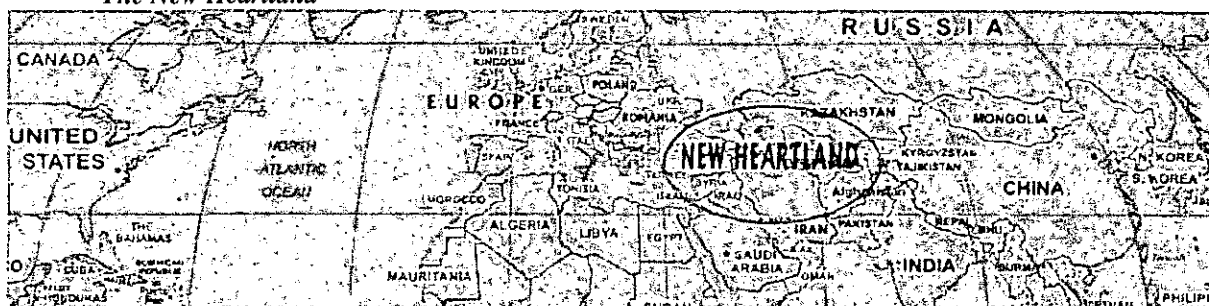
The New Heartland

The neighbouring countries to the Global Balkans – Russia, Turkey, Israel, India, Pakistan – have limited capabilities to contribute substantially to its stabilization. Israel is not seriously involved in the Global Balkans, while each of the others, starting with Russia, failed to do so in the past. Because of its failure in Afghanistan, Russia is not able to play a leading role in the region, India can not get involved due to its conflict with Pakistan, while Turkey takes a low profile because of the Kurdish issue. In such conditions, without the cooperation of the above countries, the US considered useful the participation of the new NATO countries (mainly Poland and Romania) to stabilize the Global Heartland. Access to the Global Heartland is critical, hence the relevance of Baltic and South Eastern European countries as a safe strategic base and of the Black Sea as a safe sea route.